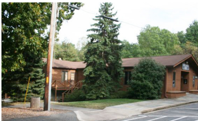
Hawk's Reach Activity Center. The start and finish location are at the telephone pole in this photo.

NOTE: the main access to the course is via the Little Bennett Campground which has a secured gate. Please call (301)528-3430 for further information.