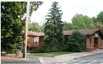
Hawk's Reach Activity Center. The start and finish location are at the telephone pole in this photo.

NOTE: the main access to the course is via the Little Bennett Campground which has a secured gate. Please call (301)528-3430 for further information.